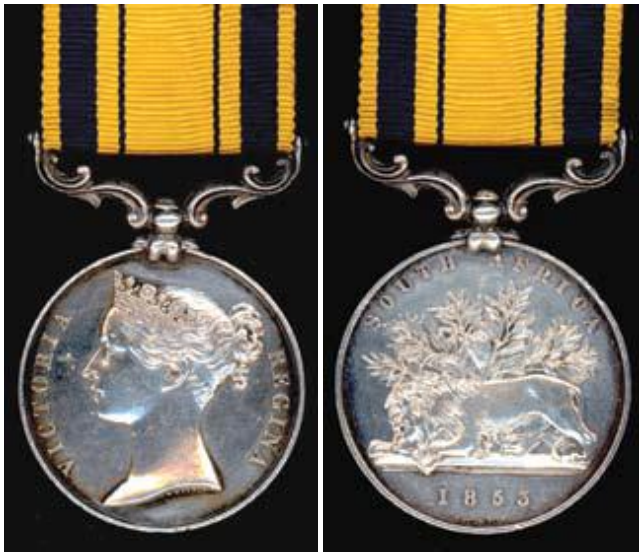
The South Africa Medal 1853 awarded to Carpenter's Mate Nicholas Trenaman, correctly impressed but misnamed 'Frenaman'.

The combination of South Africa and Arctic 1818-55 medals is particularly rare: 16 sailors were entitled to both medals, but according to the medal rolls , both medals were issued in only nine instances. However, readers should bear in mind that, simply because no dispatch details exist for any one intended medal recipient, there is no absolute certainty the medal was not issued. Cases are known where officially named medals appear on rolls without any dispatch details, but they were indeed issued and are extant.