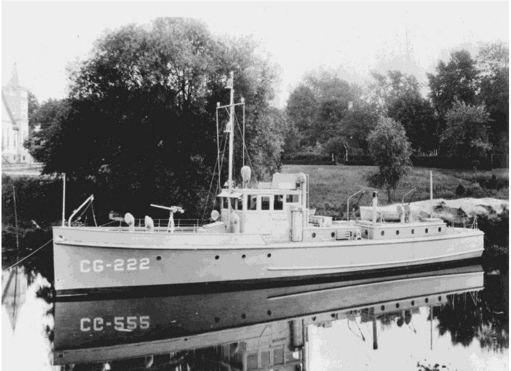
U.S. Coast Guard Small Cutters and Patrol Boats, 1915-2012