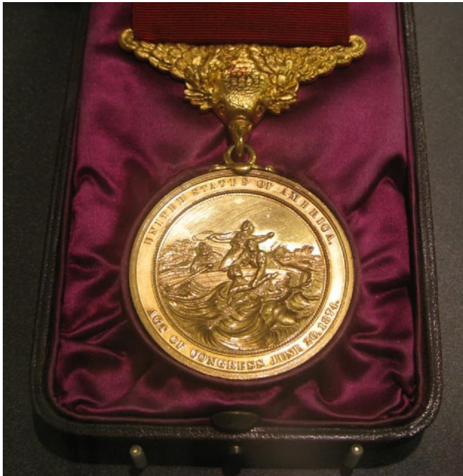
Milwaukee Public Museum U.S. Gold Lifesaving Medal, as issued between 1882-1949.